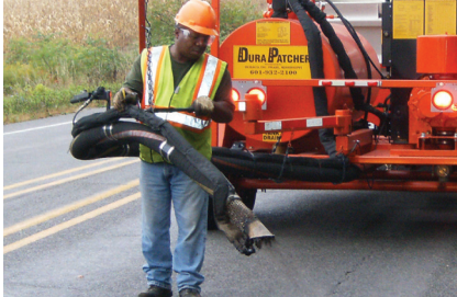
Ergonomic No-Stress boom