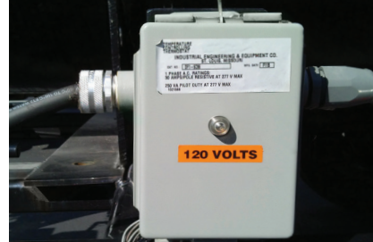
Over night heating system