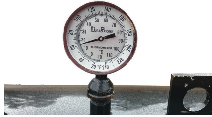
Large Temperature Gauge