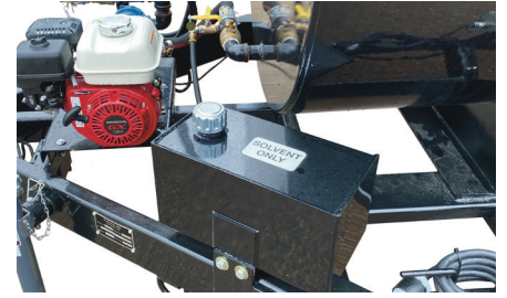
5 Gallon Solvent Tank For System Flush