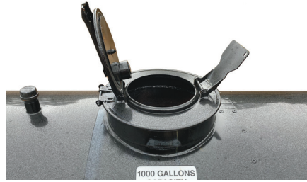
Large 14" Lockable Tank Fill Port