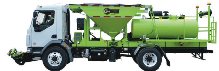
P5™ One-Person Patcher with DuraPatcher™ Technology