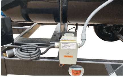
Electric Overnight Heating System