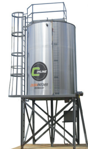
T-Series™ Stationary Emulsion Storage Tanks