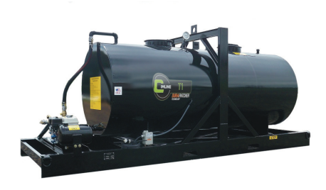
Skid Model Available