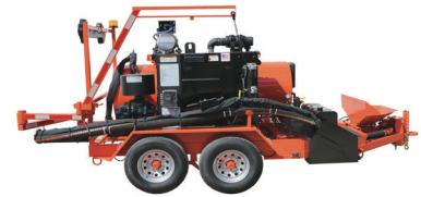
P2™ Two-Person Patcher with DuraPatcher™ Technology