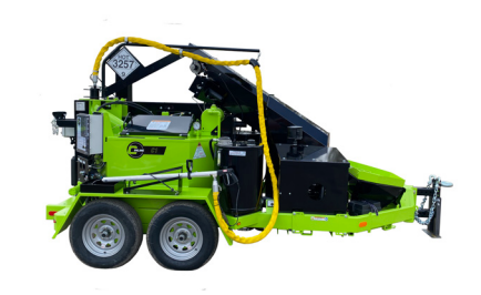
C1 Combination Mastic/Crack Sealer Melter Applicator