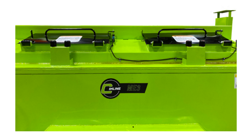
67 Inch Loading Door Height