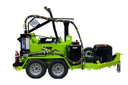
M2 230 Gallon Crack Sealer Melter Applicator