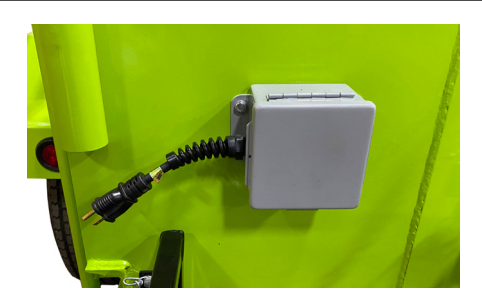
Dual Overnight Heating Probes