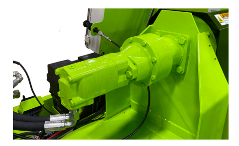
Powerful Hydraulic Agitator Motor