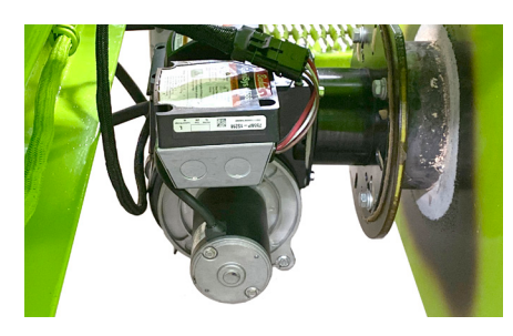
340,000 BTU Diesel Material Tank Burner