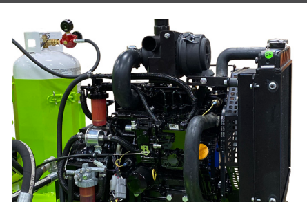
19 HP Isuzu Tier IV Diesel Engine