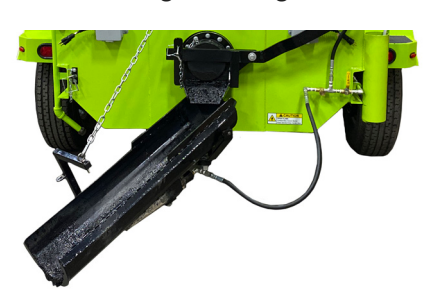
Wide Reach Propane Heated Chute