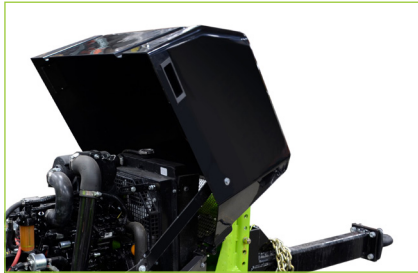
Optional engine cover