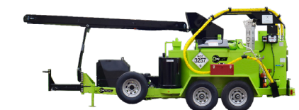
M4 dual hose, dual pump and conveyor