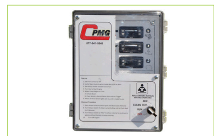
Simple seal controller