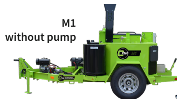
M1 without pump