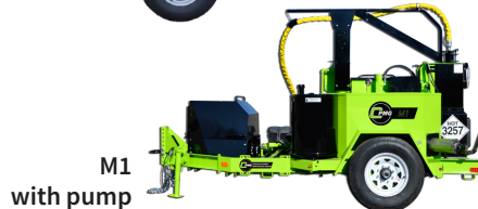
M1 with pump