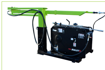
Optional X2, Carry-On Air Compressor