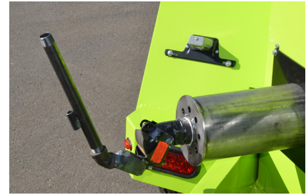
Optional heated draw-off option