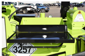
Lowest Height Largest Door

The reputation for simple, safe, and sustainable operation lives on with the M-Series, which marks a new chapter for Cimline™ with signature safety green paint. Going green means more than a paint color change as the M-Series comes standard with lower emissions, lower fuel consumption, and quieter operation for a better work environment. The low-profile design, high production, and ease of use continue to make Cimline the crack sealing leader.