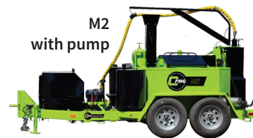
M2 with pump