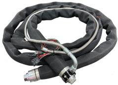
Durable M-Series Heated Hose

The reputation for simple, safe, and sustainable operation lives on with the M-Series, which marks a new chapter for Cimline™ with signature safety green paint. Going green means more than a paint color change as the M-Series comes standard with lower emissions, lower fuel consumption, and quieter operation for a better work environment. The low-profile design, high production, and ease of use continue to make Cimline the crack sealing leader.