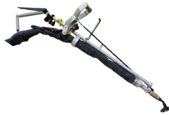
M-Series™ Lightweight Wand