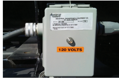
Overnight heating system