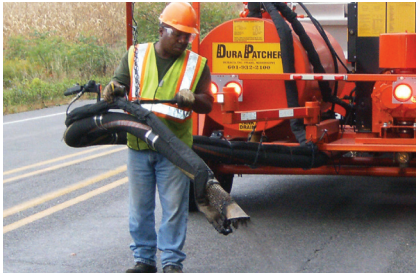
Ergonomic no-stress boom