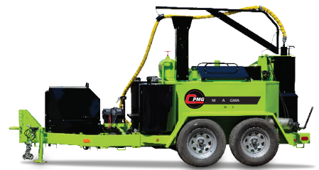
M-Series Crack Sealers